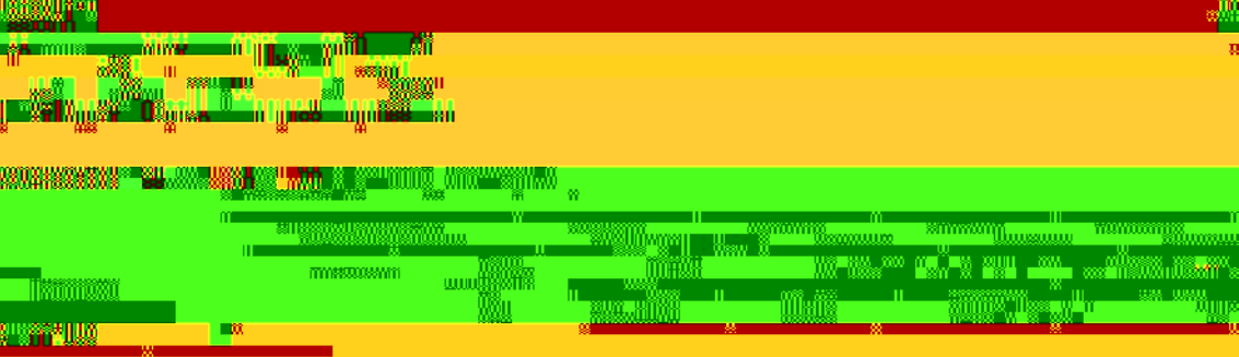
Figure 3: Corrosion Rate of 304 and 316 Stainless Steel Pipes in 10% NaCl Solution